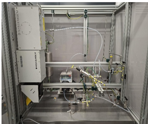
Figure 2: Testing facility for PEC water splitting at HyCentA

Source: Hisatomi, T.; Kubota, J.; Domen, K. Recent advances in semiconductors for photocatalytic and photoelectrochemical water splitting. Chemical Society reviews 2014, 43 (22), 7520–7535. DOI: 10.1039/c3cs60378d.