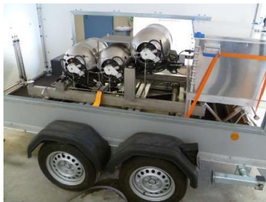
Source: Mobile device of NOW for taking H 2 samples