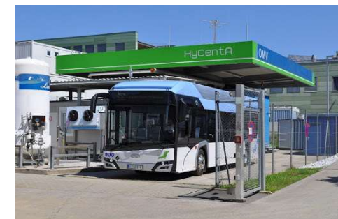
FC-Bus at HyCentA facility