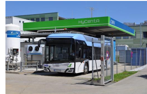
FC-Bus at HyCentA facility