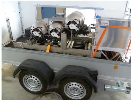
Source: Mobile device of NOW for taking H 2 samples