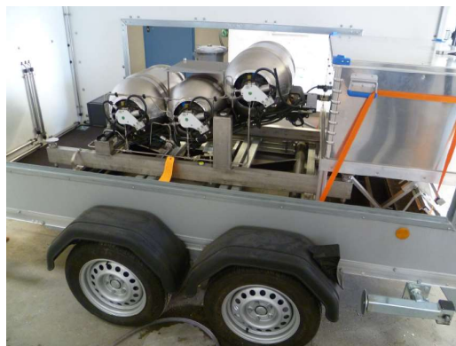
Source: Mobile device of NOW for taking H 2 samples